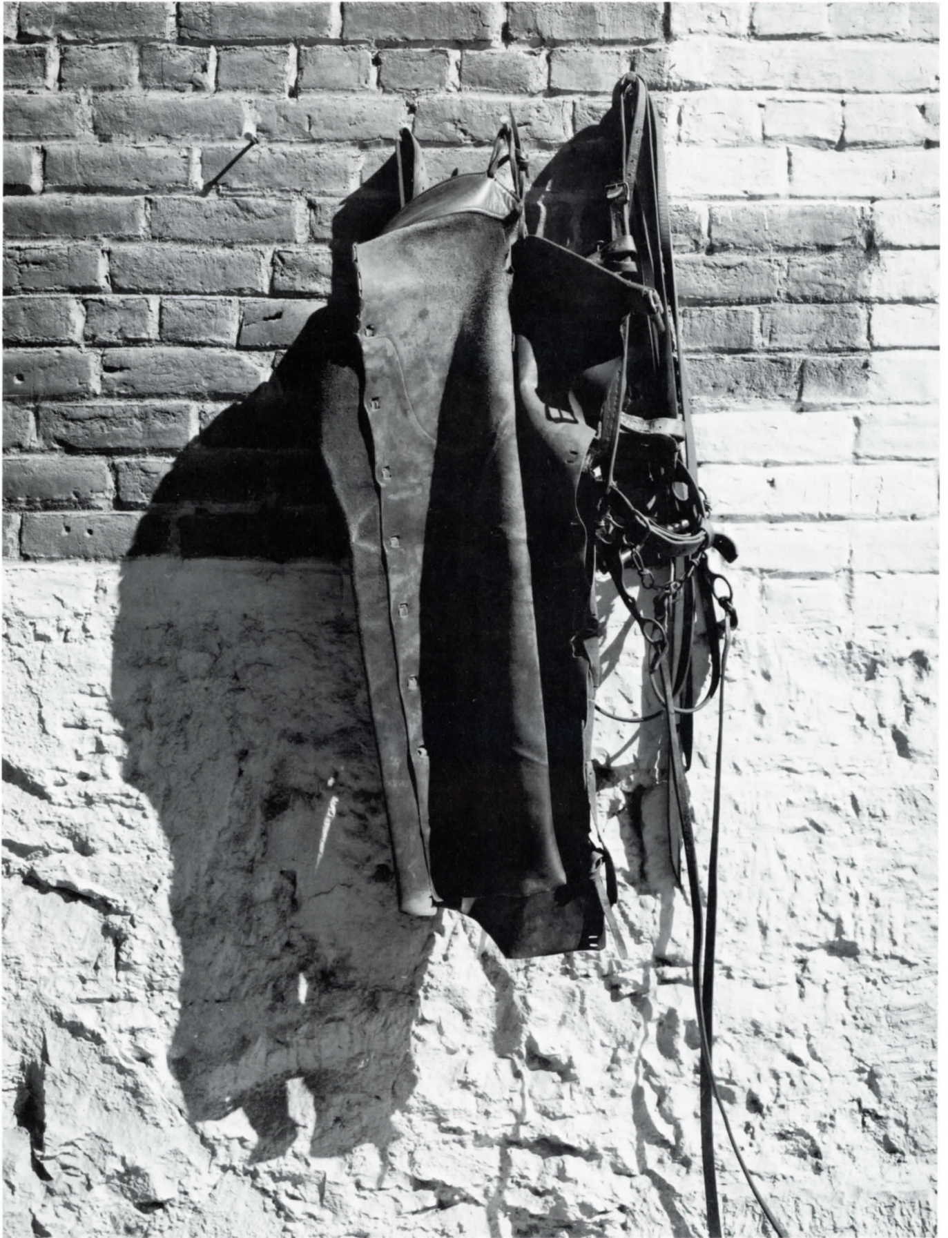
Chaps and Stable